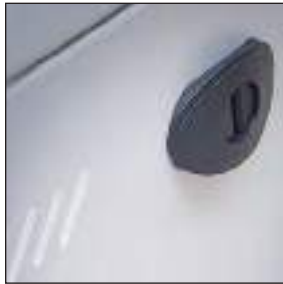
Side removable panels with air vent