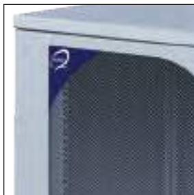
Gridded door available on request